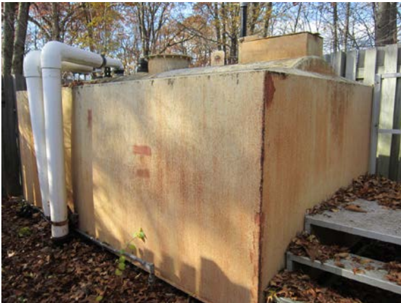
Photograph E-13. 2,000-gallon fuel oil AST on the west side of the Shepherd of the Sea Chapel.