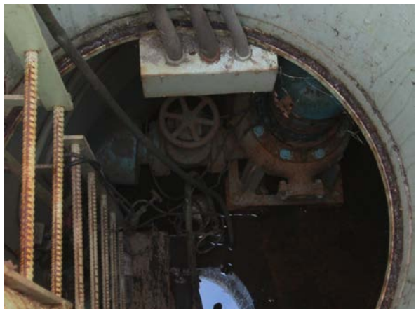
Photograph E-12. Inside the sewer lift station.