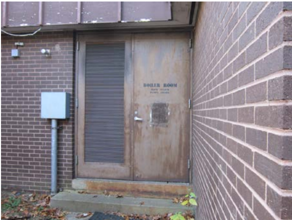
Photograph E-7. Entrance to the Shepherd of the Sea boiler room.