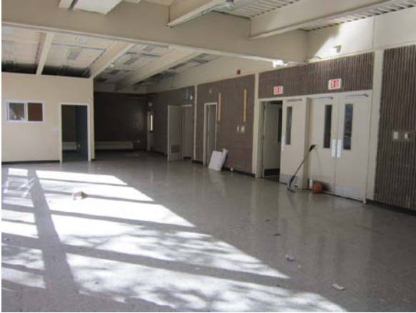
Photograph E-19. Main room in Building 1004 (east side of building).