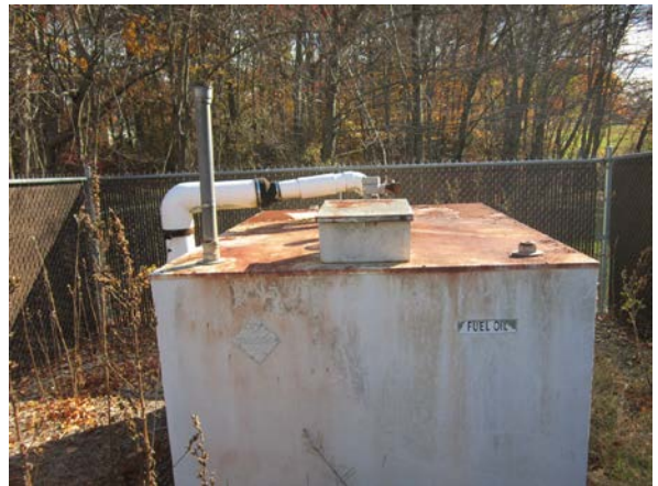
Photograph E-24. Fuel oil AST on the southeast side of Building 1004.