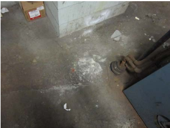
Photograph E-9. Repaired floor from fuel lines from AST.