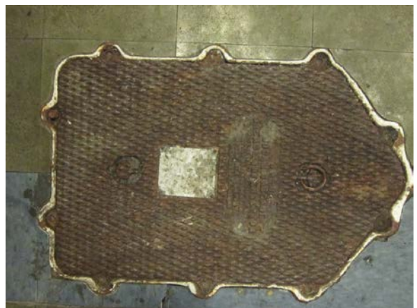
Photograph E-4. Grease trap in the kitchen of the Shepherd of the Sea Chapel.