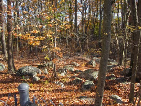
Photograph E-31. Wooded area north of Building 1004 (looking north).