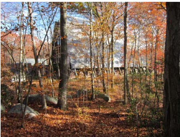
Photograph E-17. Wooded area south of the Shepherd of the Sea Chapel (looking north).