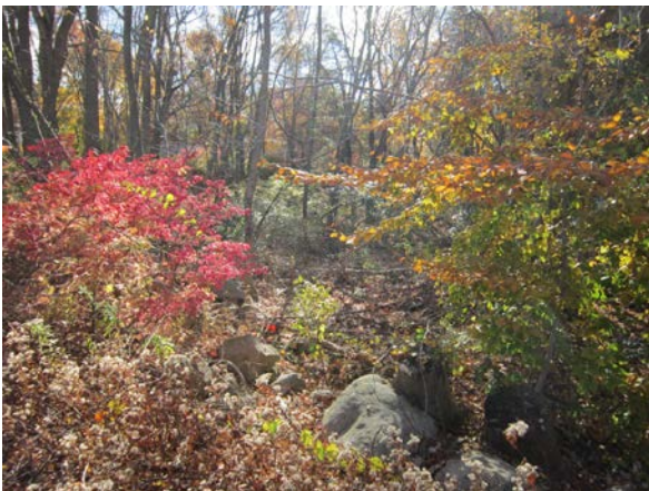
Photograph E-29. Wooded area southeast of Building 1004 (looking southeast).