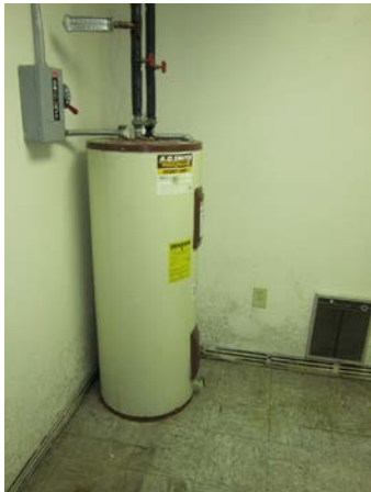
Photograph E-21. Water heater inside Building 1004.