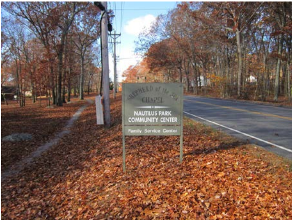
Photograph E-1. Sign for the Shepherd of the Sea Chapel and Building 1004 on Gungywamp Road.