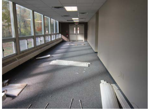
Photograph E-20. Room on south side of Building 1004.