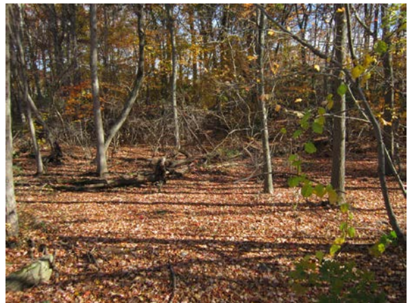
Photograph E-30. Wooded area east of Building 1004 (looking north).