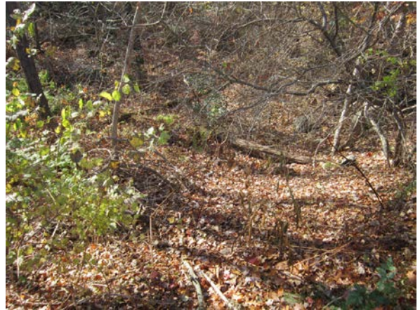
Photograph E-34. Wooded area south of the parking lot (looking south).