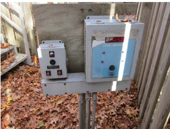
Photograph E-15. Fuel monitor system for 5,000-gallon AST (not in working condition).