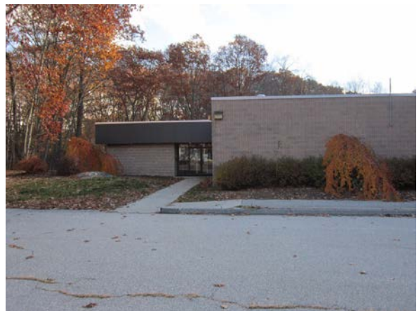
Photograph E-18. Entrance to Building 1004.