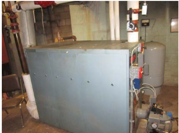
Photograph E-8. Boiler for the Shepherd of the Sea Chapel