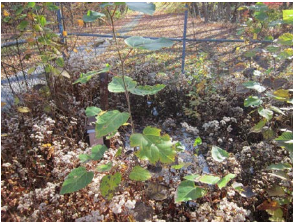
Photograph E-23. Sewer lift station south of Building 1004 (in fenced area).