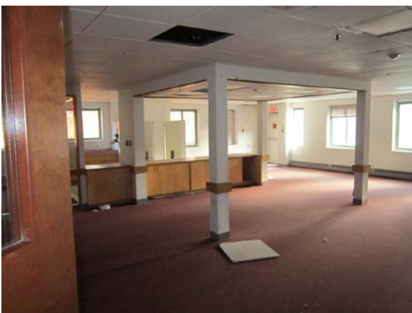
Photograph E-5. Classroom in the religious education addition of the Chapel.