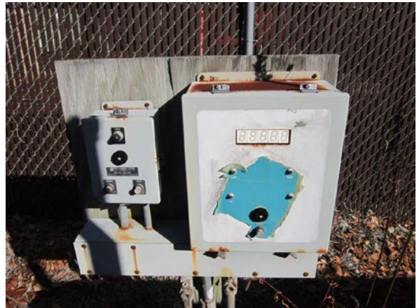
Photograph E-26. Fuel monitor system for 2,000-gallon AST (not in working condition).