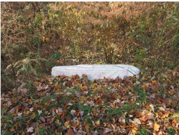
Photograph E-27. Mattress in wooded area south of Building 1004 (looking south).