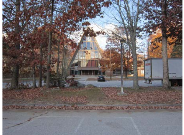
Photograph E-32. Parking lot for the Shepherd of the Sea Chapel and Building 1004 (looking west).