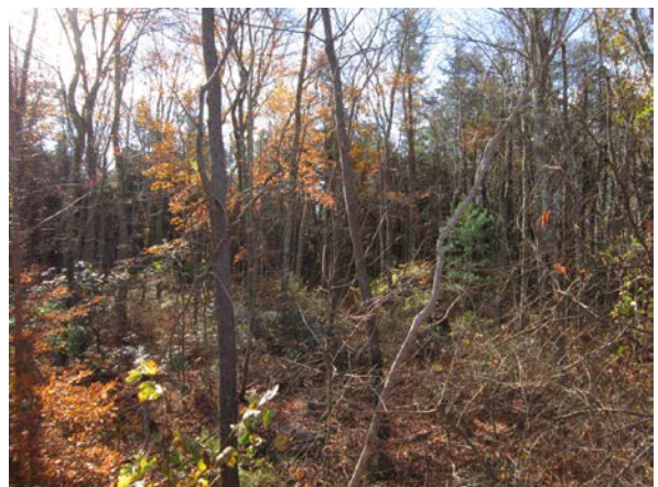
Photograph E-16. Wooded area south of the Shepherd of the Sea Chapel (looking south).