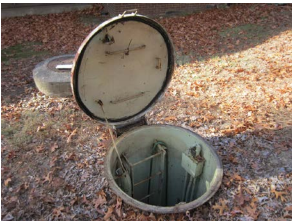
Photograph E-11. Sewer lift station north of the Shepherd of the Sea Chapel.