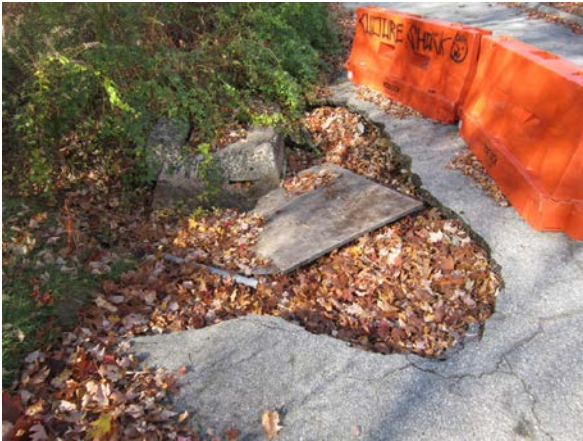
Photograph E-33. Damaged asphalt at south end of the parking lot.