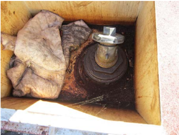
Photograph E-25. Fill port for 2,000-gallon fuel oil AST.