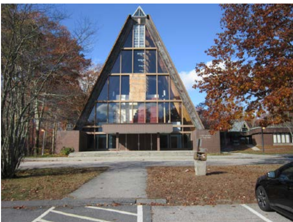
Photograph E-3. Entrance to the Shepherd of the Sea Chapel.