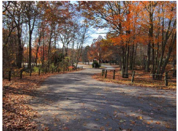
Photograph E-2. Driveway leading to the Shepherd of the Sea Chapel and Building 1004.