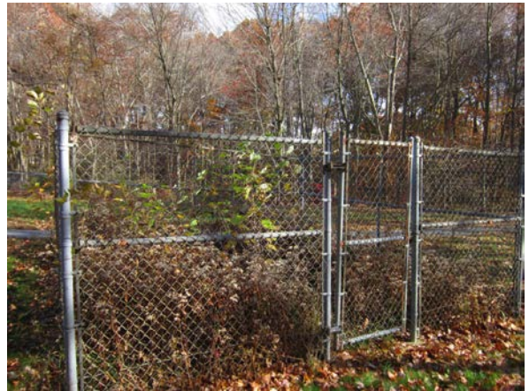
Photograph E-22. Sewer lift station south of Building 1004 (in fenced area).