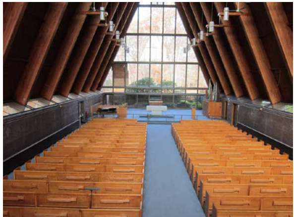
Photograph E-10. View of the main chapel.