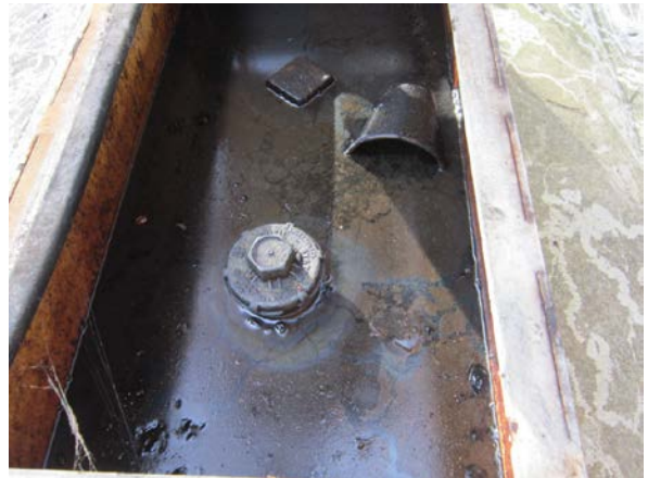
Photograph E-14. Fill port for the 2,000-gallon AST.