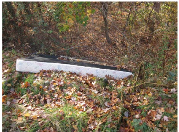
Photograph E-28. Box spring in wooded area south of Building 1004 (looking south).