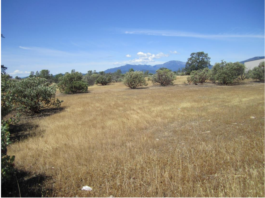
Overall View of Subject Property Looking Southeast